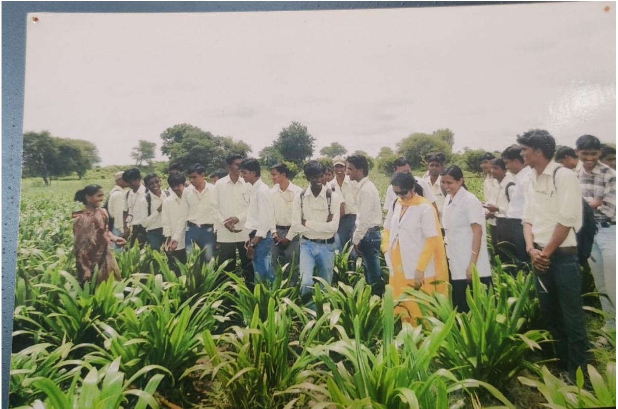
Agricultural visit of Students