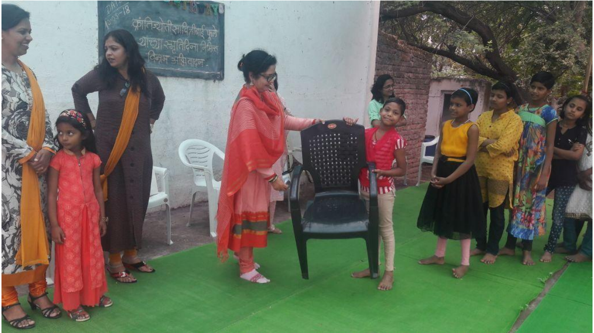
Distribution of chairs in orphanage home, Amravati