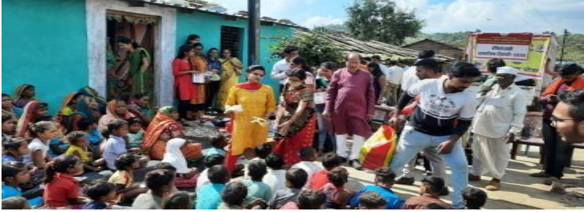
Visit to Adivasi Village and distributed Cloths and Medicine