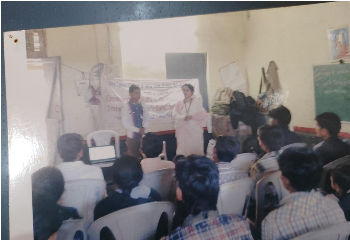
English Communication Workshop in NSS Camp