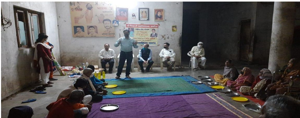
Visit to Old Age Home